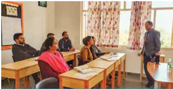
Teacher Training Workshop by expert subject heads from prominent Delhi Schools. Stress was laid on Maths enrichment and importance of testing.