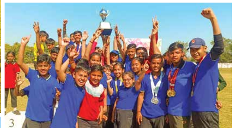
Annual Sports Day Awards