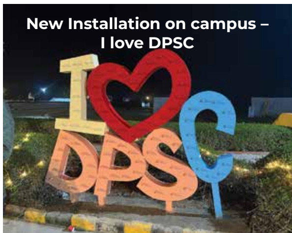
New Installation on campus – I love DPSC