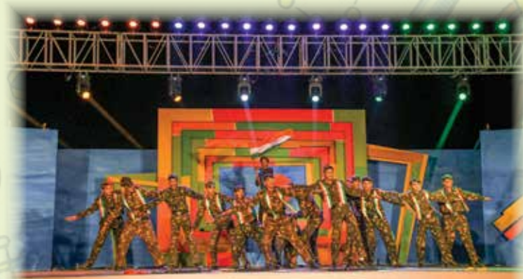
Mega Annual Concert -KALEIDOSCOPE 2022