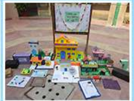
Rain water harvesting