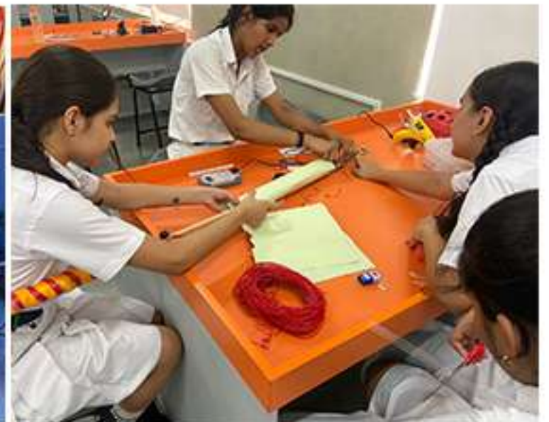
Grade 8 - Smart Stick for the blind