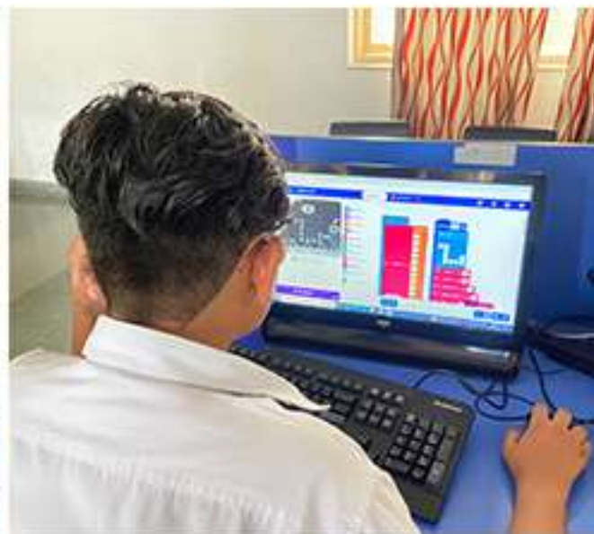
Grade 8 - Digital Compass