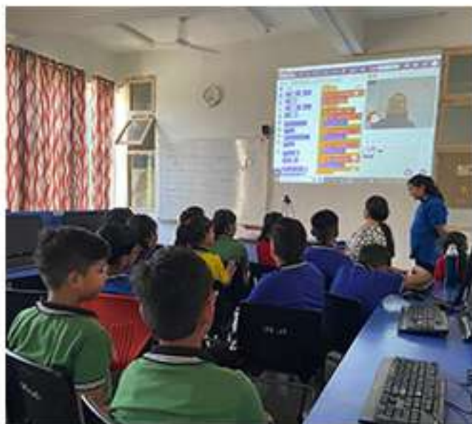
Grade 5 - Face Detection

Partnered with Tesseract Delhi: An organisation helping schools train teachers and build curriculum for IT Labs.