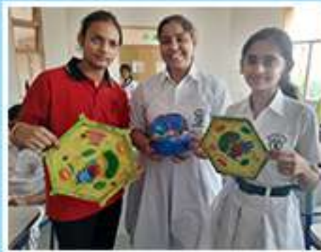
Plant & animal cell

Our students enjoyed the models and projects making related to their classroom learning. They were most engaged in creating and ideating these projects. Experiential learning provides better understanding of topics.